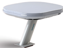
EXAMPLE OF THE PEREGRINE u8 INSTALLED ON AN OFF-THE-SHELF PEDESTAL